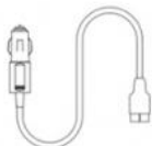
12V-14V car charger cable